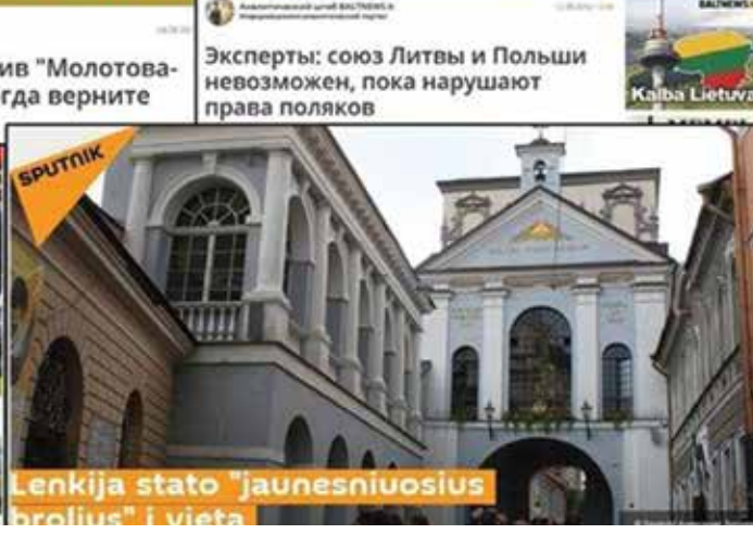
Эксперты: союз Литвы и Польши невозможен, пока нарушают права поляков