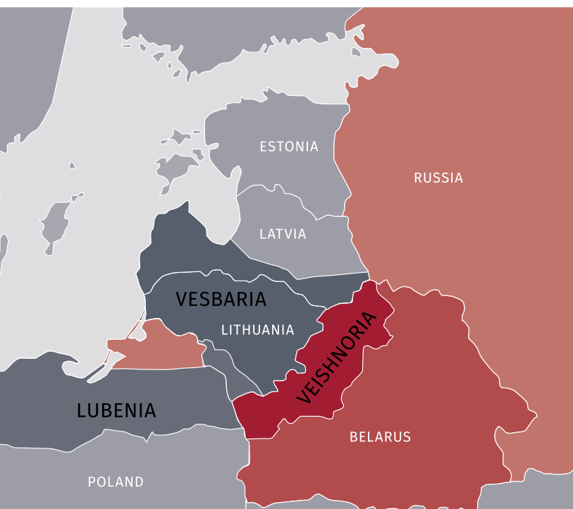
Element of Zapad-2017 scenario map

Although Minsk declares its neutral stance, the Zapad-2017 exercise once again proved that Belarus does not dis-