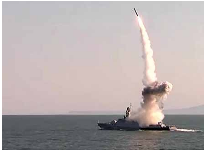
Cruise missile launch from Kalibr system.

On 5 February 2018, the first short range missile systems Iskander-M were delivered to the home base of the 152 nd Missile Brigade in Kaliningrad Oblast to replace the legacy systems Tochka-U. The new systems are capable to use both conventional and nuclear payload and can engage the ground targets within the distance of 500 km.