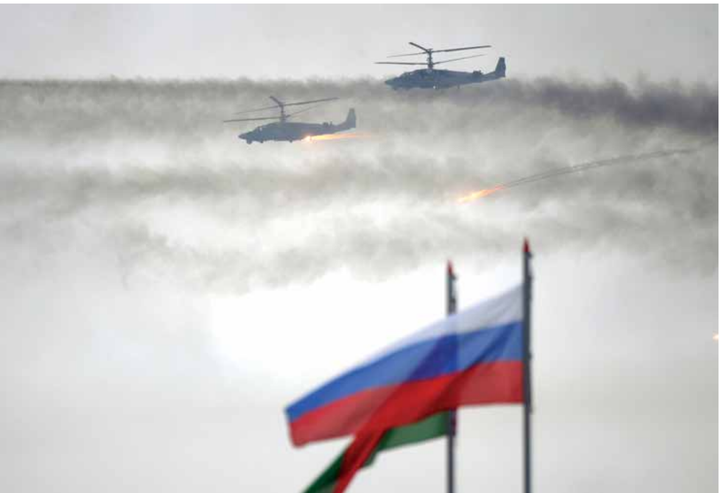
Russia – Belarus exercise Zapad-2017.

Russia presented to the states of the region false information about the prospective exercise geographical coverage, number of participants, and the scenario. The scale and complexity of the exercise show that it was not an antiterrorist exercise, but a check of operational plans