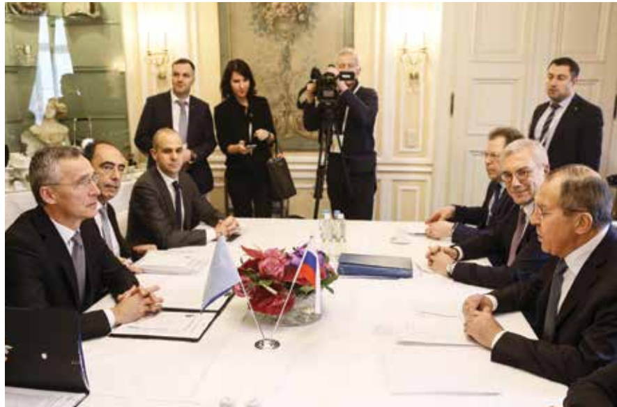
NATO – Russia delegations meet during Munich Security Conference in 2018.

In 2017, Russia tried to bring some positive dynamics into relations with the West and European states, and its political leadership mostly used more moderate tone than in previous years. This was induced by approaching Russia's presidential elections and the World Cup 2018 hosted by Russia. Another reason was relatively unsuccessful years of 2015-2016 for Russian diplomacy, which revealed that an openly confrontational behaviour in most cases did not work out and provided negatives results. Russia had expectations related to elections in the USA, France and Germany, as it hoped for more favourable stance of the Western states towards Russia. The essential goal of Russian policy adjustment was an attempt to weaken the sanctions regime and increase the Russian influence on the processes in NATO and European Union (EU). Russia attempted to improve bilateral relations with individual NATO and EU members with the aim to erode unified NATO and EU stances regarding Russia.