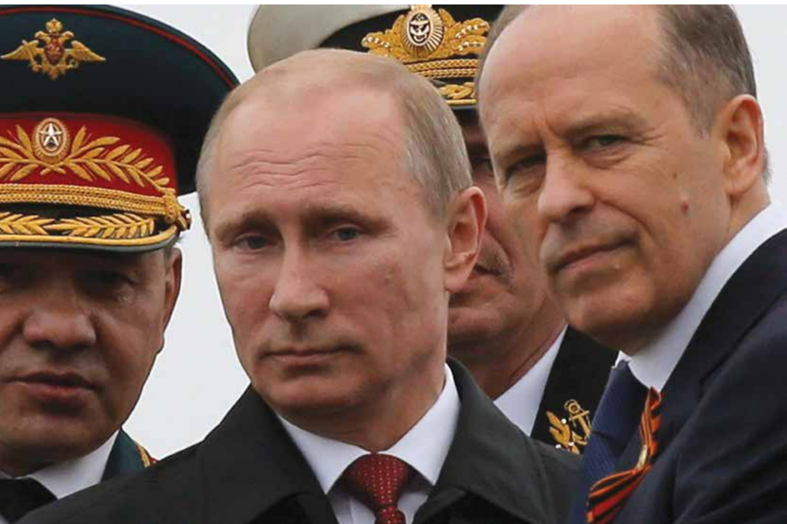
Russian Minister of defence, President and Director of FSB.