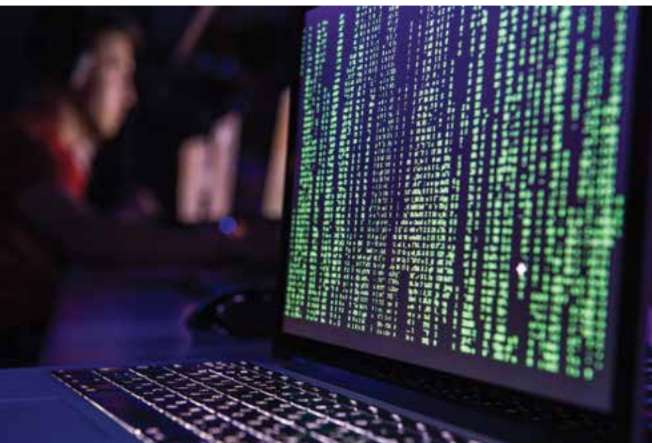
Cyber attack.

Lithuania and other NATO member states. For the spread of malicious code the group mainly used social engineering. APT28/Sofacy is engaged in both, information collection and influence operations. In 2017, the USA exposed information that APT28/Sofacy hacked the computer network of the Democratic National Committee in 2016 and also attacked a U.S. company producing elections-related hardware and software. In addition, the group is suspected of leaking emails of the campaign team of French president Emmanuel Macron and attempting to disrupt the process of the accession of