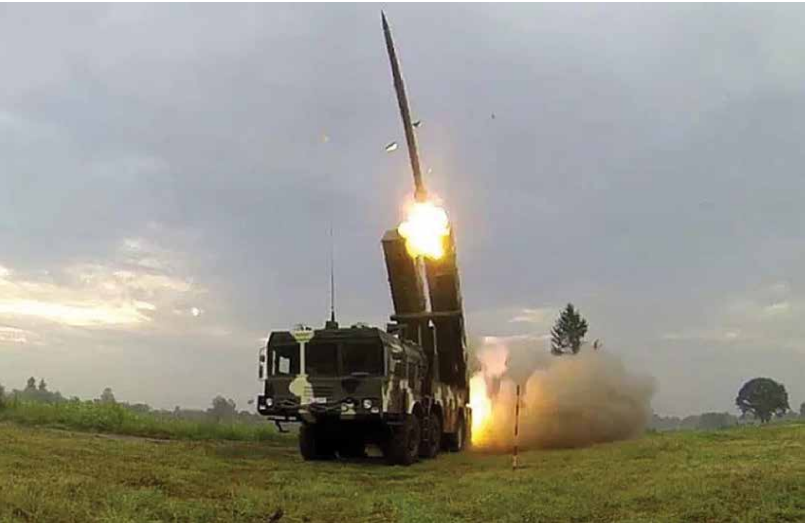
Multiple launch rocket system Polonez.