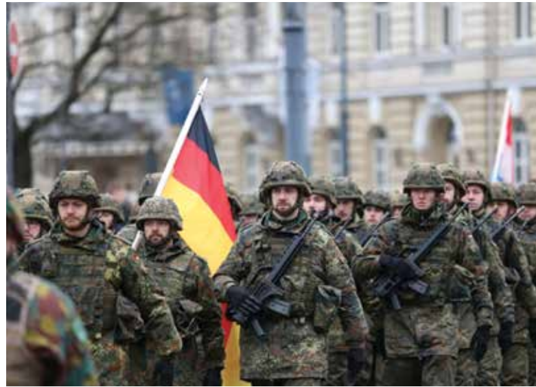
NATO eFP troops. Photo by Ieva Budzeikaitė

Russia's Armed Forces (AF) daily activities and exercises indicate that it took into account the increased NATO military capabilities in the Baltic region. Nevertheless, there are no indications that it would make a direct impact on the essential decisions of Russian political and military leadership. The development of Russian AF in the region is a continued implementation of plans that were made yet before 2014 (i.e. before Russia's aggression in Ukraine caused crisis in relations with the West). These plans and their implementation are being modified by Russian economic possibilities and lessons learned during the AF reform, however they are not directly related to NATO eFP deployment or other actions of the Alliance.