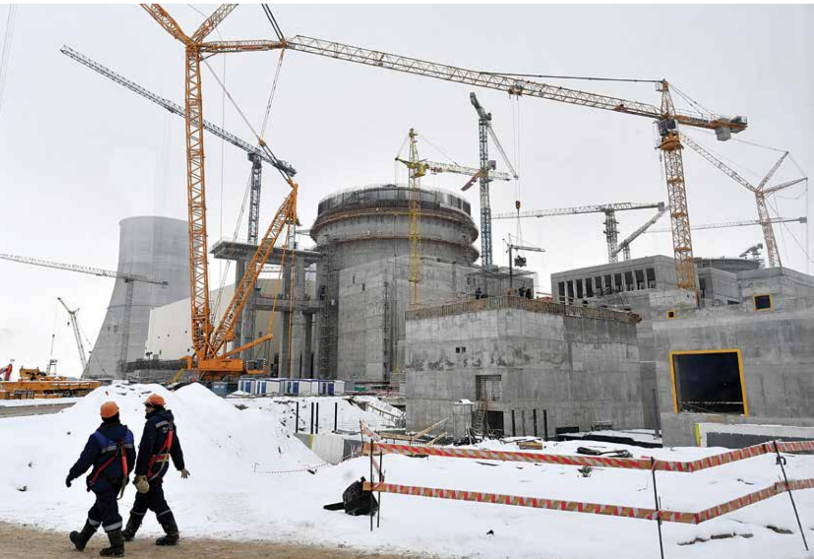
Astravets Nuclear Power Plant.