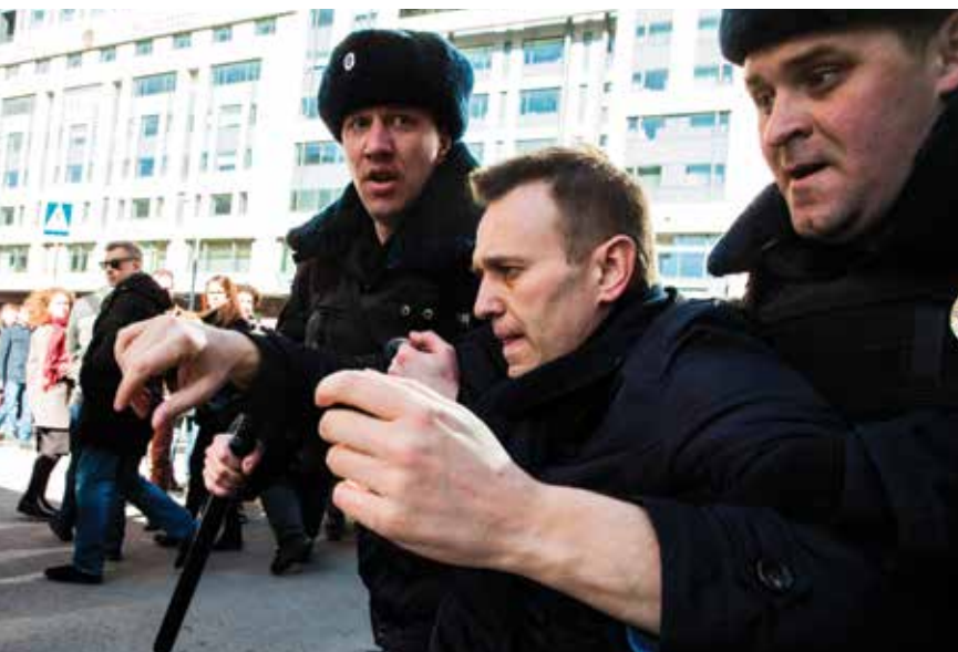
Aleksey Navalny arrest during anti-corruption protests in 2017.

their organizers were under pressure and got persecuted by law enforcement agencies. A surge of anticorruption protests that swept Russian cities and towns in 2017 revealed that the country's youth is not that politically passive as the older generation and it is prone to demand systemic changes in the state's political life. The younger generation does not subscribe to Putin's statements that political stability is the value in its own right. After all, a possibility that the protests could impel the ruling regime to make any structural reforms is extremely low in the upcoming years.