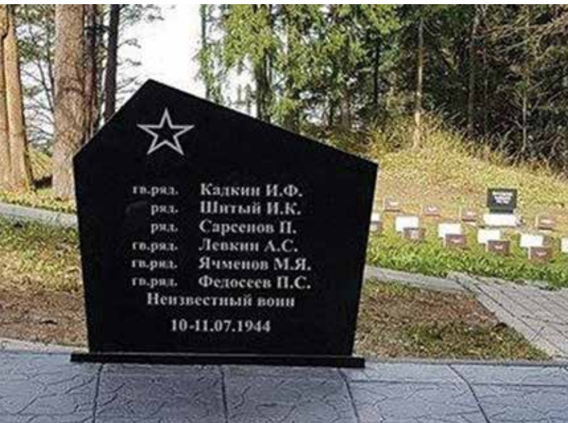
Illegally built monument.

In Lithuania, Russia makes attempts to involve pro-Russian individuals and organizations into projects of preservation of the military heritage. Such individuals conduct excavations of burial sites and without proper examination seek to reburial the discovered remains as Soviet soldiers. Subsequently, attempts are made to legitimize the burial and re-burial sites as new objects of the Soviet heritage.