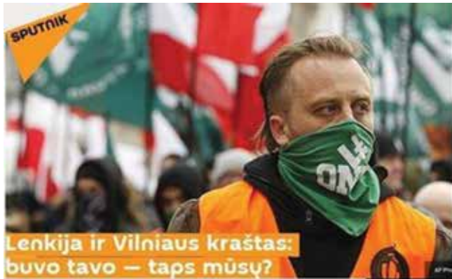
Lenkija ir Vilniaus kraštas: buvo tavo – taps mūsų?