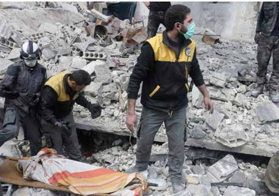
Search and rescue works in Eastern Ghouta, Damascus, Syria.

Despite the devastating defeats, loss of resources and influence, ISIL still remains one of the most powerful terrorist groups in the region as well as worldwide. ISIL has proven of being capable to rapidly adjust to changing circumstances, therefore it will highly likely adapt to a current situation. Through the large networks of sleeping cells ISIL will perpetrate attacks in Iraq and likely in other Middle East countries. The member states of NATO and EU will also remain the targets for ISIL that will seek to inspire its followers to stage attacks in the West.