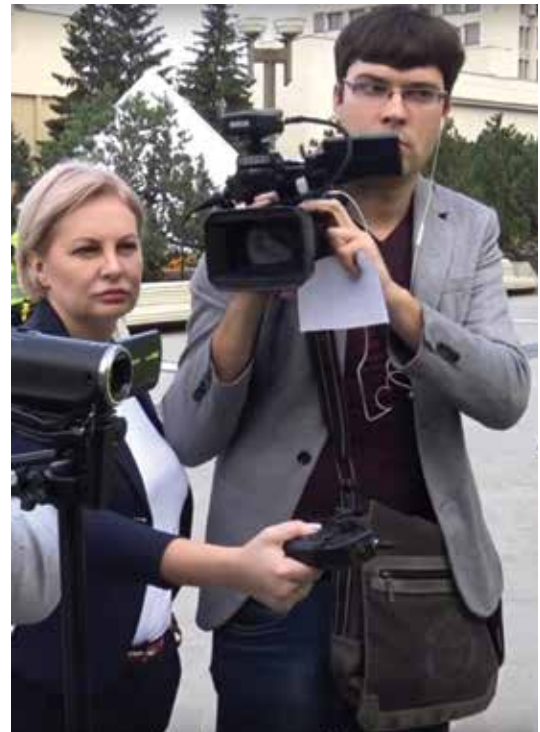
Russian propagandists arriving to conduct reports in Lithuania by concealing true reasons of their visits

As expected, during Zapad-2017 exercises the Baltic States and Poland were portrayed as the main countries spreading 'paranoia' in respect to Russia. This was to create a divide between the alleged 'Russophobic camp' and the 'moderate West'. However, the hostile communication line was of secondary importance. The main efforts of Russia's strategic communication were focused on the supposed transparency and openness seeking to improve relations with the West.